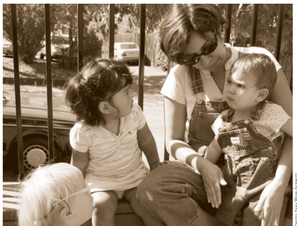
Every major research study on infant and toddler care has shown that small group size and good ratios are key components of quality care.

What is known: Infants form emotional bonds, or attachments, with their parents. As increasing numbers of mothers work outside the home (Oser & Cohen, 2003), child development experts, parents, and nonparents alike have been concerned about whether infants enrolled in out-of-home care can form secure attachments with caregivers. Evidence (Dalli, 1999; Honig, 1998; Raikes, 1993, 1996) now suggests that infants and toddlers can and do form secure attachments with infant care teachers, and that those who do make such attachments function better in care. Not only do secure attachments with caregivers benefit those babies who have them, but their lack may well make child care a lonely, stress-filled, and learning-limited experience. Experts in child development (Belsky, Spritz, & Crnic, 1994; Honig, 2002) believe that the security of a child's attachments is strongly related to his development of a positive sense