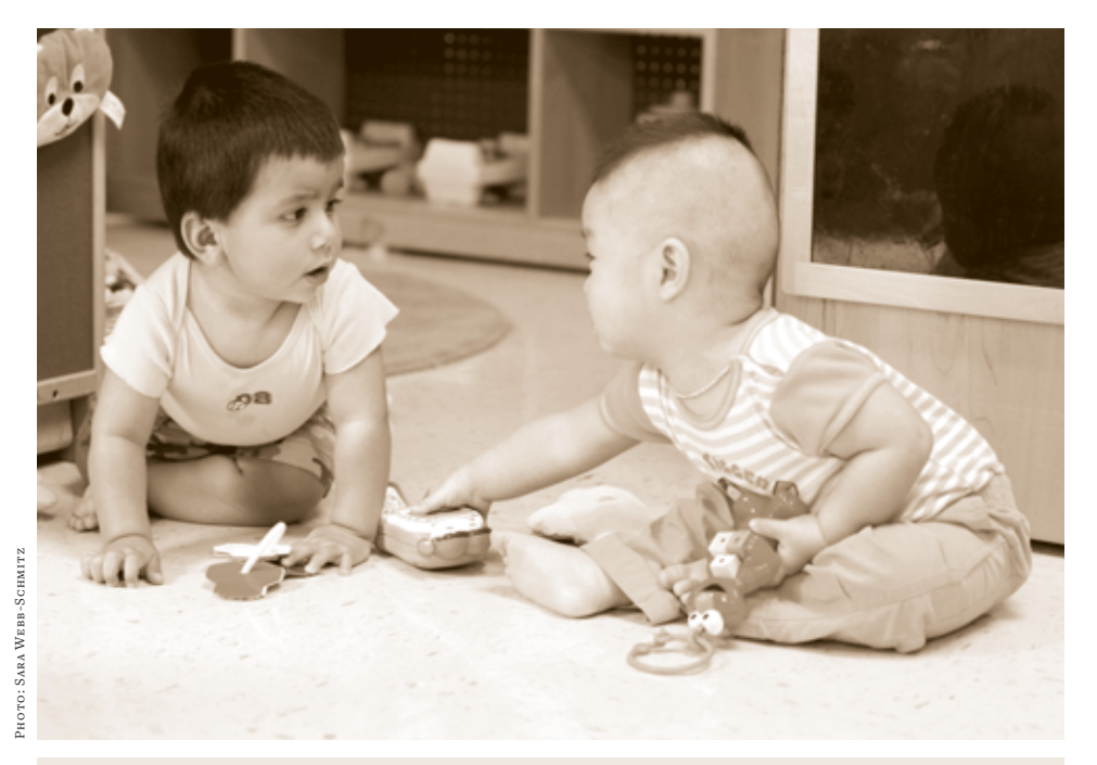
Experiences for infants and toddlers are now being designed with the infant's developing sense of self in mind.

of self-worth and the ability to have positive social relationships later in life.