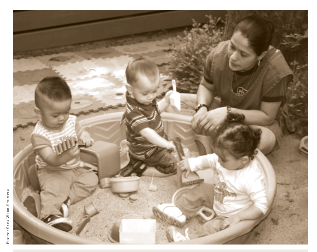
In fant care teachers are caring facilitators of the child's journey toward emotional, cognitive, language, physical, and social competence.

described important differences between how babies learn in comparison to older children (2009b). According to Gopnik, adults mistakenly believe that infants learn the same way school age children do. In school, adults set objectives and goals for children and try to get the children to focus on the skills and content they should master. However, research shows that baby learning is different. "Babies aren't trying to learn one particular skill or set of facts; instead, they are drawn to anything new, unexpected or informative" (p. WK10). Gopnik's research shows that infants are not very good at planned focus but very good at the exploration of the real world objects they are interested in and interaction with the people around them. She concludes that "Babies are designed to explore and they should be encouraged to do so" (p. WK10).